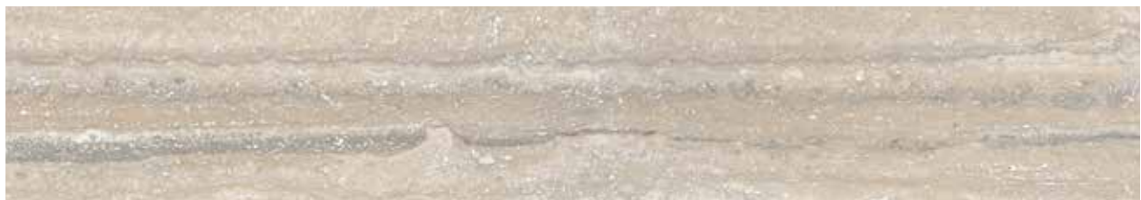
Mottled Beige 12" x 24" : FLSRI636 8" x 48" : FLSRI637 24" x 48" : FLSRI638

View collection web page for the complete offering including additional product options, corresponding Spec ID# and updates.