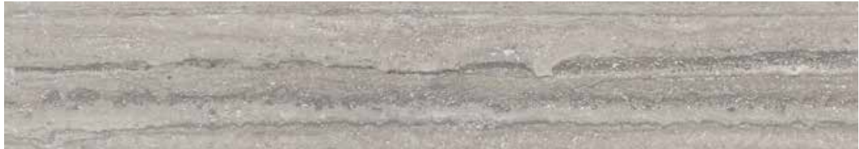
Mottled Platinum 12" x 24" : FLSRI633 8" x 48" : FLSRI634 24" x 48" : FLSRI635