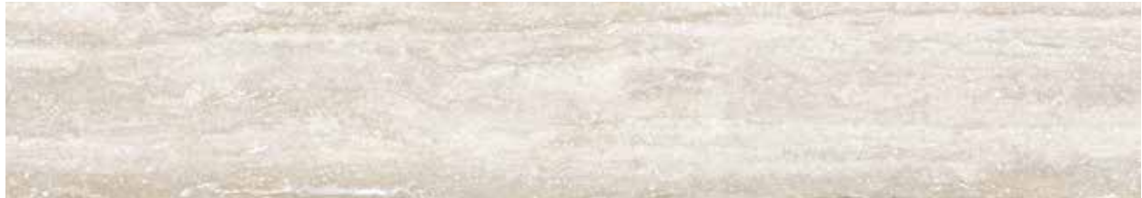
Mottled Blanc 12" x 24" : FLSRI630 24" x 48" : FLSRI632

Like the ancient, rocky outcrops of the islands dotting the Mediterranean, Aegean Travertine Porcelain has a sun-worn look in three soft, neutral beach tones. Reflecting the beauty of natural marble, the sustainable planks provide classic authenticity and timelessness to any commercial environment where a high-performing product is required.