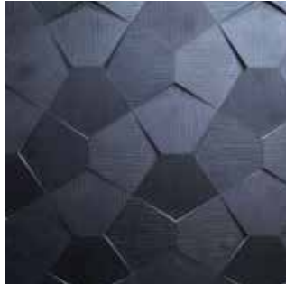
Wood Grain Laminate - WPFSN095

Crossfuse® Wood Panels is the next edition to the Fusión Wood Panels . A myriad of handcrafted three-dimensional patterns are defined by masterful construction and exceptional design. Comprised of reclaimed wood species, including Teak, Ipe, Ironwood and Walnut veneers, this collection is also sustainable. Patterns and species are interchangeable and are also available in HPL laminates over MDF.