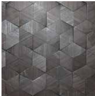
Ipe - WPFSN104

View collection web page for the complete offering including additional product options, corresponding Spec ID# and updates.