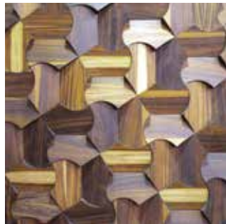
Ironwood - WPFSN102