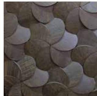
Ipe - WPFSN103