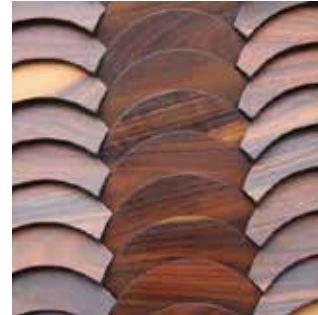
Ironwood - WPFSN097