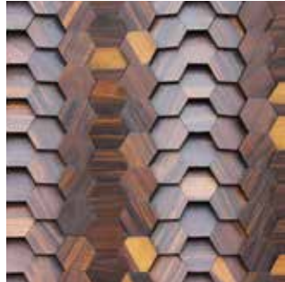
Ironwood - WPFSN096