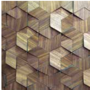
Walnut - WPFSN098