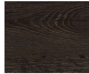
2mm: FLBMD033 5mm: FLBMD034