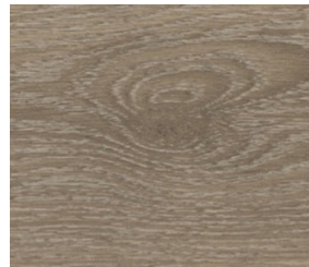
2mm: FLBMD047 5mm: FLBMD048