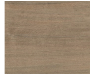
2mm: FLBMD049 5mm: FLBMD050