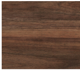
2mm: FLBMD029 5mm: FLBMD030