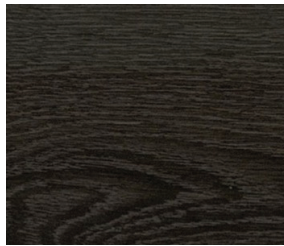
2mm: FLBMD035 5mm: FLBMD036