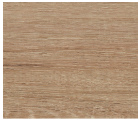
2mm: FLBMD027 5mm: FLBMD028

Cerussa Luxury Vinyl is a new robust collection that reflects the technique of accentuating the grain to capture the detail and character of a natural hardwood. Modernity echoes authentic and timeless design with 7" wide scratch-resistant planks, glue-down or loose lay installation and 14 statement making colorations all in a neutral palette.