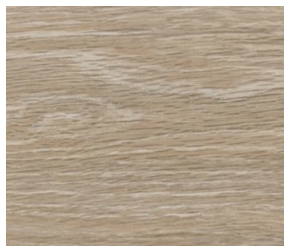
2mm: FLBMD051 5mm: FLBMD052