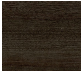
2mm: FLBMD037 5mm: FLBMD038