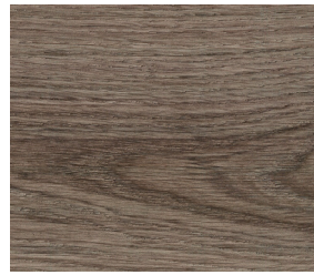
2mm: FLBMD031 5mm: FLBMD032