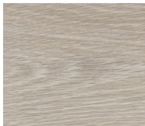
2mm: FLBMD053 5mm: FLBMD054

View collection web page for the complete offering including additional product options, corresponding Spec ID# and updates.