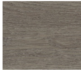
2mm: FLBMD039 5mm: FLBMD040