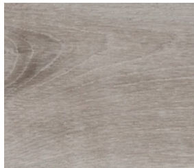
2mm: FLBMD045 5mm: FLBMD046