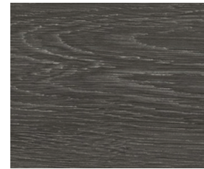
2mm: FLBMD041 5mm: FLBMD042