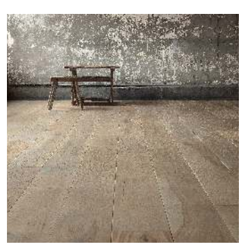
Installation Photo Featuring Newcastle Hardwoods - FLADR541

View collection web page for the complete offering including additional product options, corresponding Spec ID# and updates.