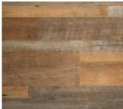
Natural Patina - WPCLB023