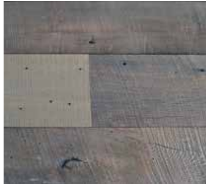
Weathered Nickel - WPCLB025