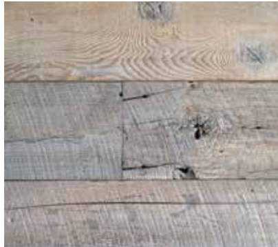
Rustic White - WPCLB024

Capture the weathered beauty of time-worn barns and other antiqued structures Made in the USA with the newly updated offering of Reclaimed Barn Wood Planks . These planks are available as a blend of mixed species and provide a piece of history, reimagined with authentic Americana color stains or in original patina for endless vintage design possibilities.