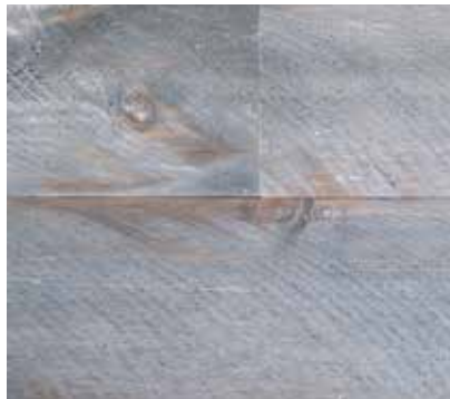
Milled Silver* - WPCLB027