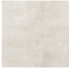
Shrewton Honed: FLSRB023 Lappato: FLSRB022