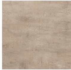
Tidworth Honed: FLSRB025 Lappato: FLSRB024