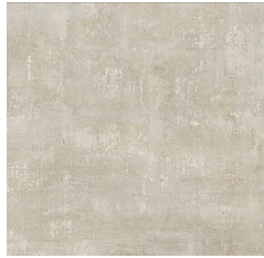
Amsbury Honed: FLSRB021 Lappato: FLSRB020