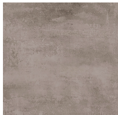
Thrupton Honed: FLSRB019 Lappato: FLSRB018