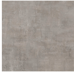
Salisbury Honed: FLSRB017 Lappato: FLSRB016