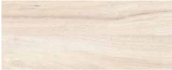
Adriatic 6" x 24": FLSRI639 8" x 48": FLSRI640

The Italian cities of the Amalfi Coast blend naturally with the striking landscape, giving a natural, old-world feel to this seaside environment. Mediterranean Wood Grain Porcelain translates the mood and tone of the region in these eco-friendly planks that mimic the artisanal character of Italian hardwood. Make an original statement with spirited style!