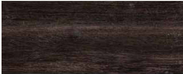
Malta 6" x 24": FLSRI643 8" x 48": FLSRI644