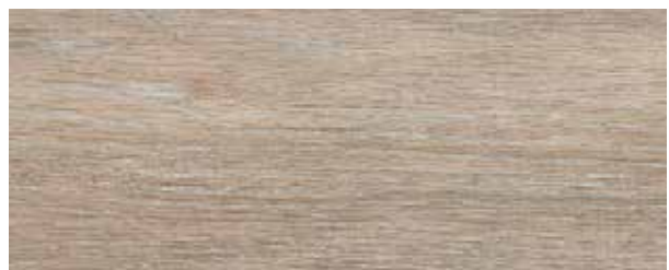
Sardinia 6" x 24": FLSRI651 8" x 48": FLSRI652

View collection web page for the complete offering including additional product options, corresponding Spec ID# and updates.