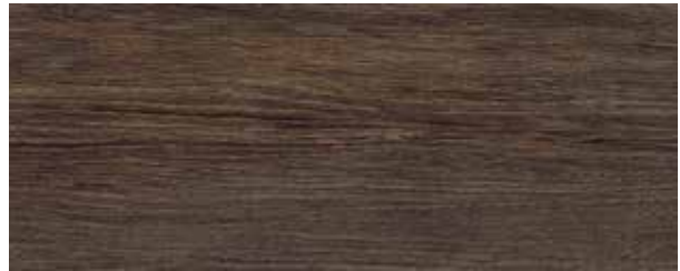
Izmir 6" x 24": FLSRI647 8" x 48": FLSRI648