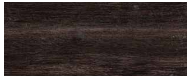
Malta 6" x 24": FLSRI643 8" x 48": FLSRI644