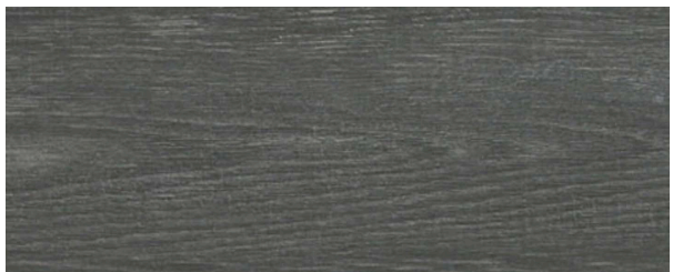
Kusadasi 6" x 24": FLSRB555 8" x 48": FLSRB556

View collection web page for the complete offering including additional product options, corresponding Spec ID# and updates.