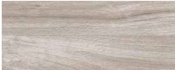
Gibraltar 6" x 24": FLSRI641 8" x 48": FLSRI642

The Italian cities of the Amalfi Coast blend naturally with the striking landscape, giving a natural, old-world feel to this seaside environment. Mediterranean Wood Grain Porcelain translates the mood and tone of the region in these eco-friendly planks that mimic the artisanal character of Italian hardwood. Make an original statement with spirited style!