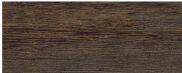
Izmir 6" x 24": FLSRI647 8" x 48": FLSRI648