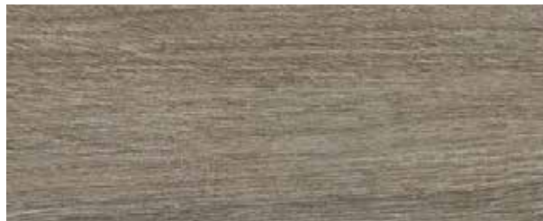
Riviera 6" x 24": FLSRI649 8" x 48": FLSRI650