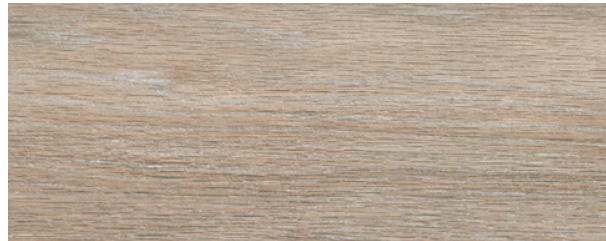
Sardinia 6" x 24": FLSRI651 8" x 48": FLSRI652