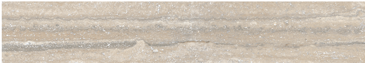
Mottled Beige 12" x 24" : FLSRI636 8" x 48" : FLSRI637 24" x 48" : FLSRI638

View collection web page for the complete offering including additional product options, corresponding Spec ID# and updates.