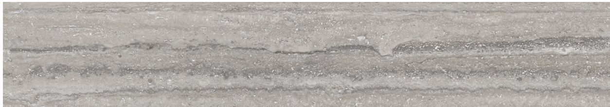
Mottled Platinum 12" x 24" : FLSRI633 8" x 48" : FLSRI634 24" x 48" : FLSRI635