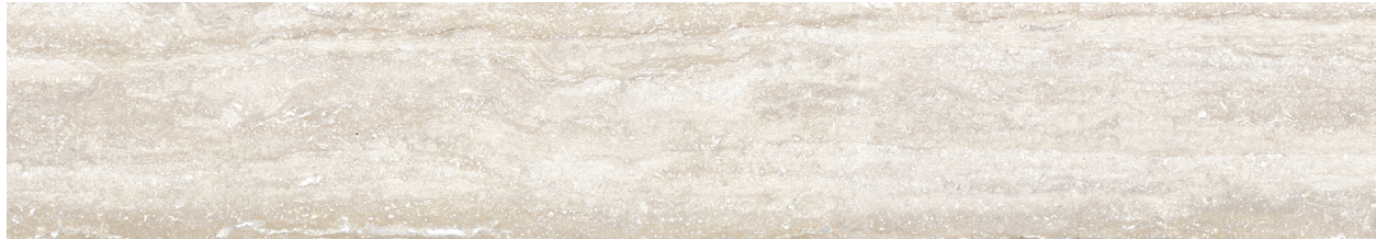
Mottled Blanc 12" x 24" : FLSRI630 24" x 48" : FLSRI632

Like the ancient, rocky outcrops of the islands dotting the Mediterranean, Aegean Travertine Porcelain has a sun-worn look in three soft, neutral beach tones. Reflecting the beauty of natural marble, the sustainable planks provide classic authenticity and timelessness to any commercial environment where a high-performing product is required.